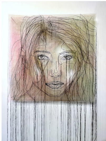
Contact, 2023, fiber art, 70x200x15 cm