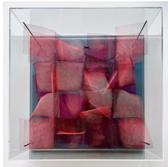
Pink on the move, 2023, fiber art, 40x40x20 cm